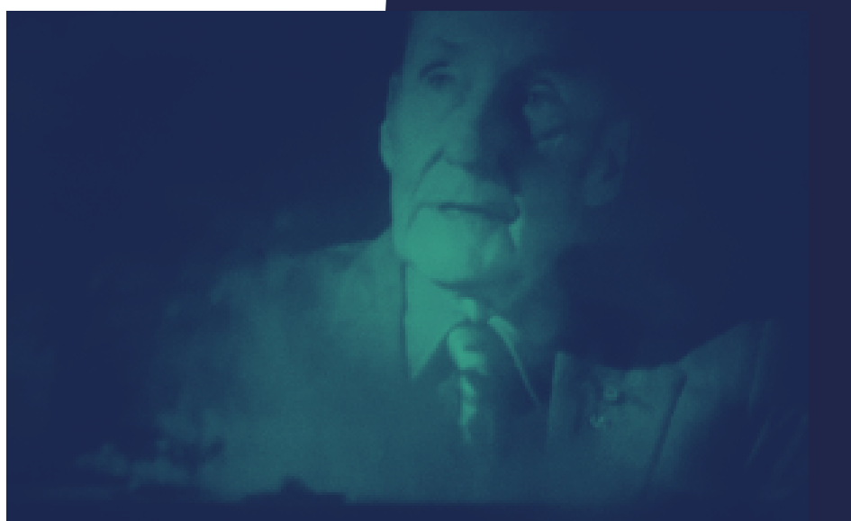
William Burroughs « A Thanksgiving Prayer »