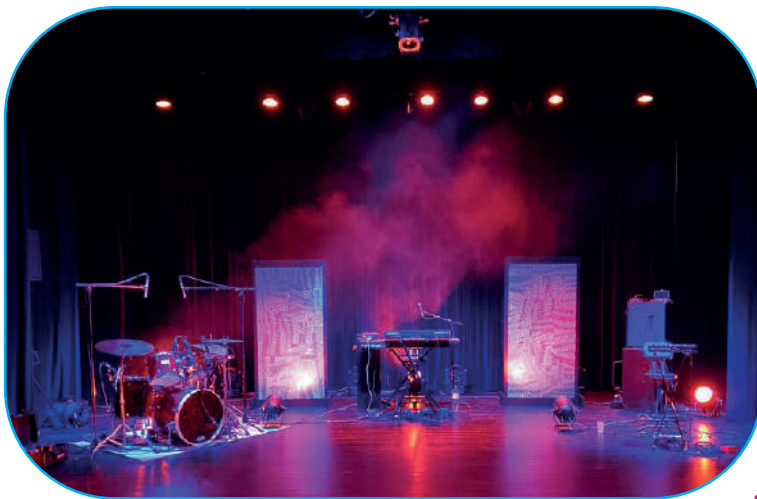
• Scénographie provisoire en 2D

The group is self-sufficient with the scenography, and it is modulated according to the hosting venue.