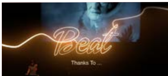
«Thanks To» BEAT