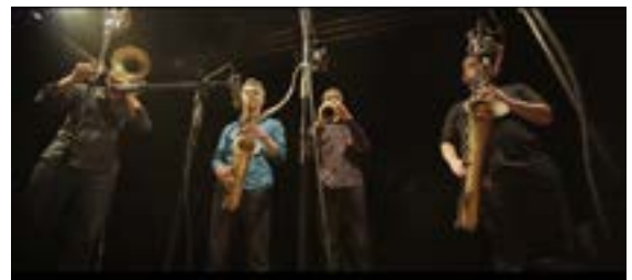
«Castelvania» LA DANSE DES INSOUMIS