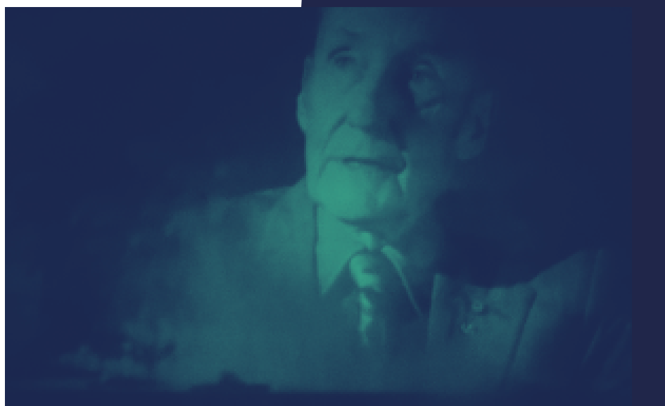
William Burroughs « A Thanksgiving Prayer »